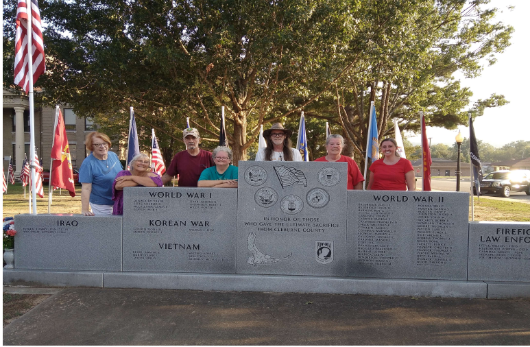
September 2023, Field of Heroes, American Legion Auxiliary, Sons of American Legion and Legionnaire volunteers.